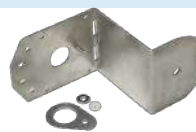
Adapter Kit 500483-24V-DM (18 per box)