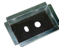
Offset Duct Board Adapter Plate 500423FM-OS

Note: The FCS003 Current Sensing Relay interlocks the UVC/UVV System with the furnace blower (this field installed option is recommended on all UVV installations).