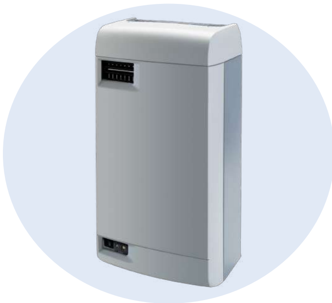
Space Steam Humidifier