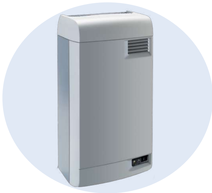
Ducted Steam Humidifier